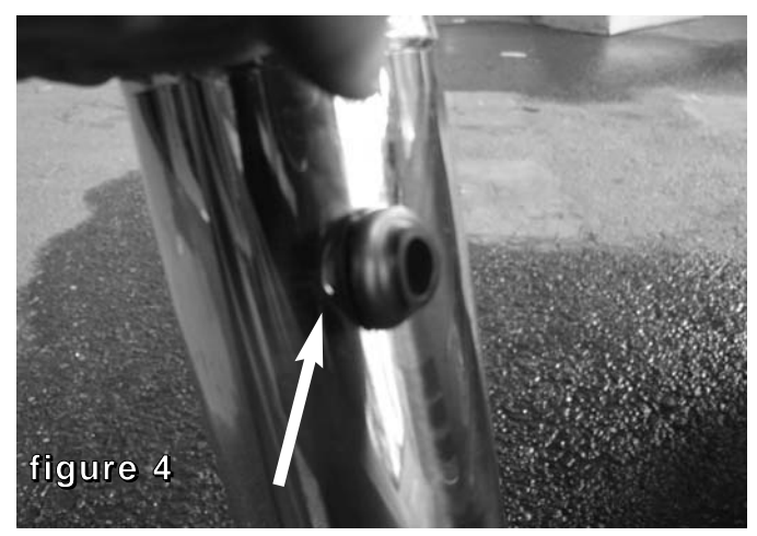
Install the grommet to the 3/4" hole on the intake tube.