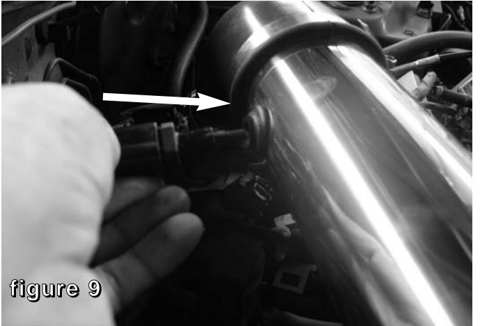
Install the temperature sensor into the grommet and secure.