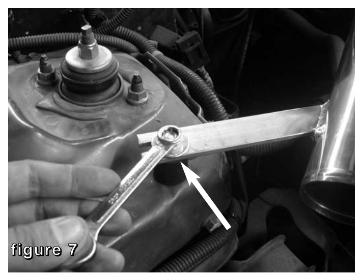
Secure the bracket using the washer and nut provided. Tighten using 10mm socket or wrench.