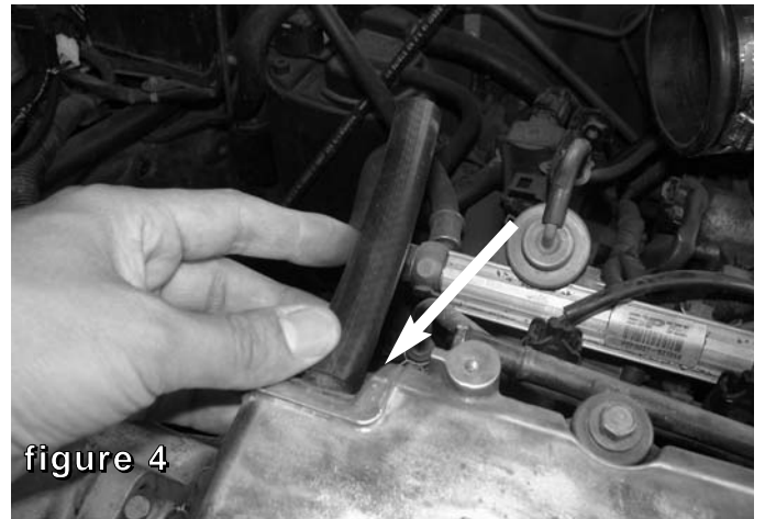
Attach to the engine crank case fitting the provided 10mm hose.