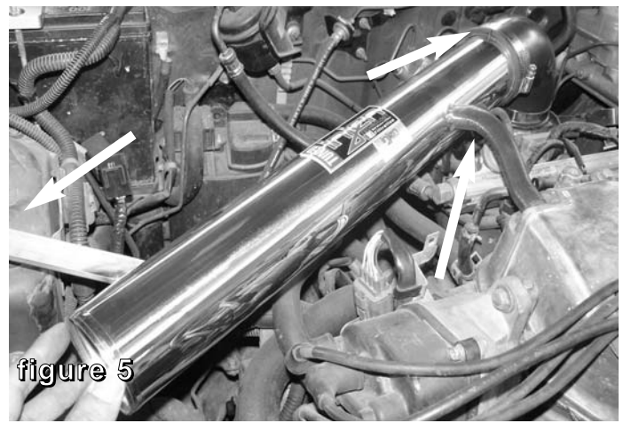
Install the intake tube position to elbow and bracket to the vibra mount. Connect the crank case line to the fitting on the intake tube.