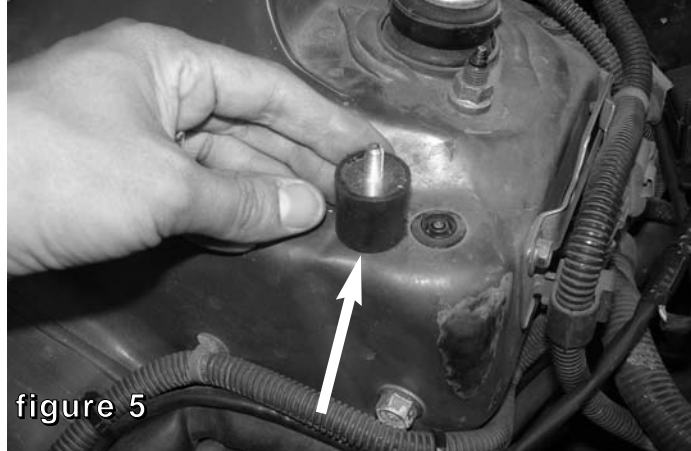
Install the vibra mount to the thredded insert located on the strut tower. Secure and tighten.