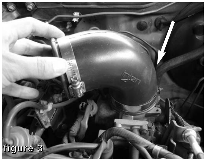
Install the elbow hose to the throttle body and secure using the 2 #48 clamps provided.