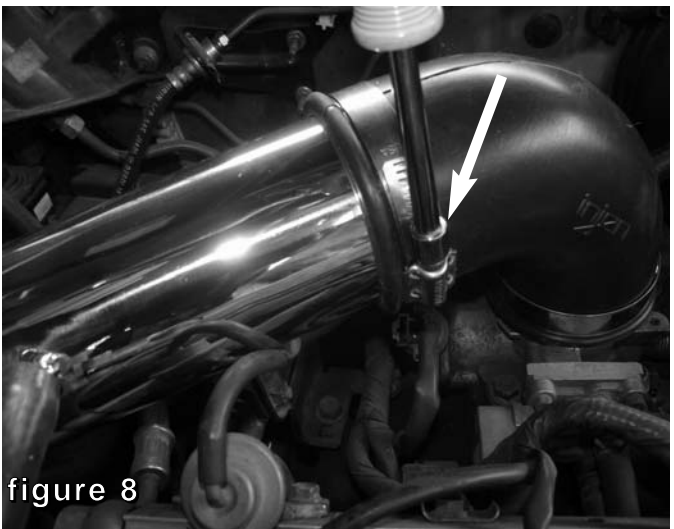
Position best fit and tighten the clamps on the elbow using 8mm nut driver.