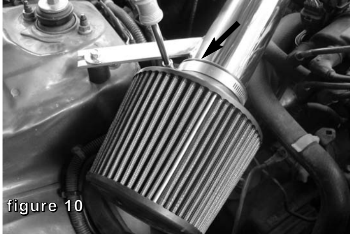
Install the filter to the tube and tighten using 8mm nut driver. Your installation is now complete. Thank you for choosing Injen.