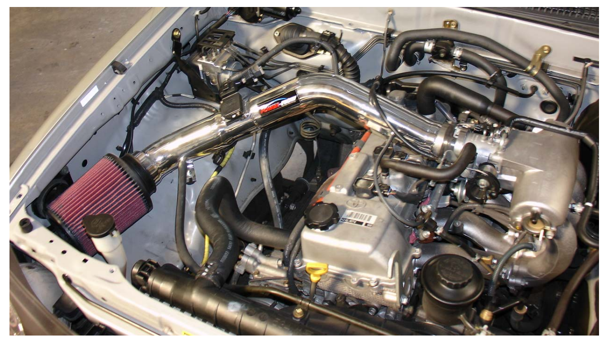
You have purchased the Worlds first tuned intake system available anywhere. The Power-Flow intake system features Injen's patent pending MR Technology used to tune the intake. With Power-Flow, calibrating of the MAF sensor is not required because the intake system comes tuned for use. Use only Injen replacement filters. The use of any other filter will change the air/fuel ratio that can cause damage to your engine.