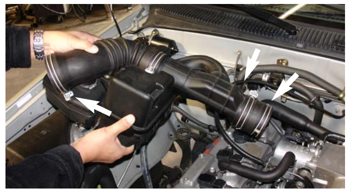
Loosen the clamps on the air intake box and the throttle body, remove the vacuum hose attached to the intake inlet and then continue to remove the air intake duct as shown above.