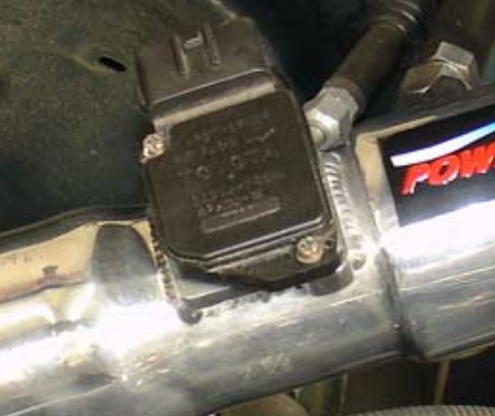
Once the mass air flow sensor has been firmly inserted into the machined sensor adapter continue to use the stock screws to fasten the sensor to the adapter