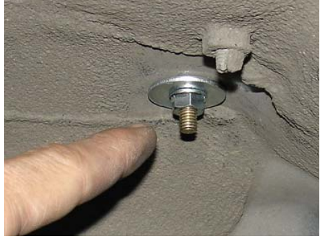
The flange nut and fender washer is fastened to the vibra-mount stud.