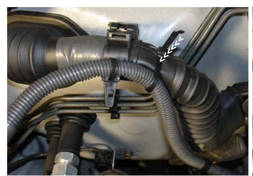
Use the zip tie to secure the sensor harness to the ECU main harness as shown above.