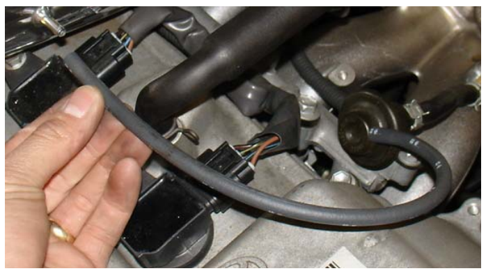
The stock 4mm pressure fuel regulator line is now pressed onto the 3/16" intake port.