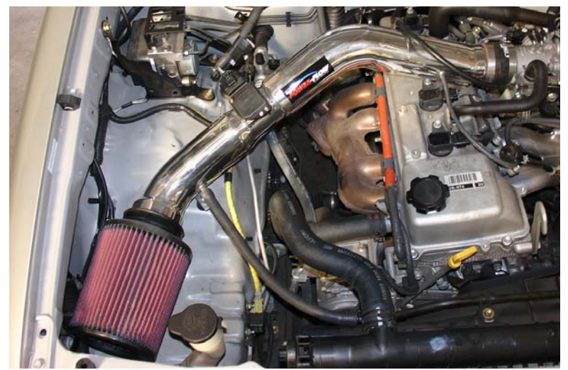
The new Hydro-shied By Injen