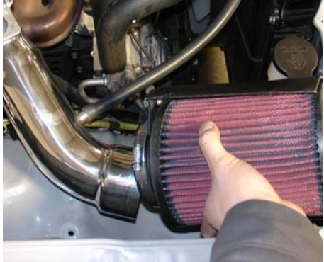
The 3 1/2" inverted top filter is set in the engine compartment ready to be installed.