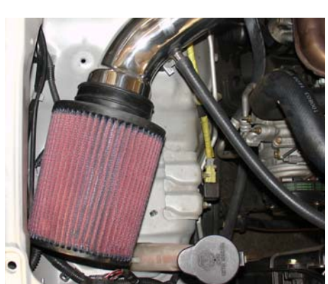
Once the filter has been placed over the intake end and the intake is set up against the filter stop continue to tighten the filter clamp.