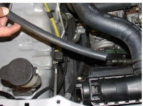
The 14" -10mm hose is pressed over the charcoal canister hard pipe.