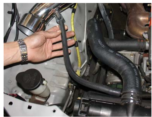
The 14"- 10mm vacuum hose is now pressed over the 1/2" intake port as shown above.