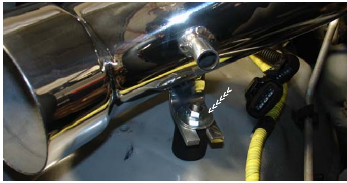
The flange nut and fender washer is screwed onto the vibra-mount stud. Do not over- tighten the flange nut at this point until the filter has been placed on the