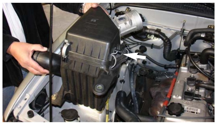
Remove the m6 bolts holding the air intake box to the fender well and the vacuum hose connected to the air box. Pull the air intake box out of the engine compartment.