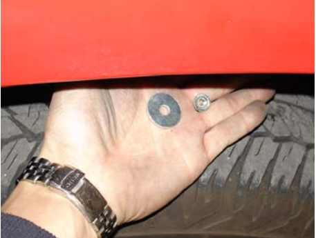
Go underneath the fender well, take the m6 flange nut and fender washer and secure the vibra-mount to the fender well.