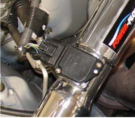
Take the harness clip and press it over the mass air flow sensor until you hear it snap in place, this will assure a good connection.