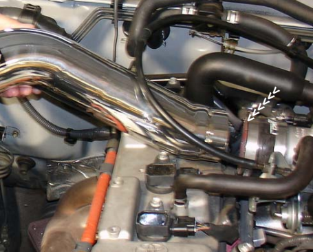
Take the intake and begin to align it to the throttle body hose as shown above.