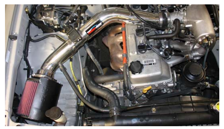
Once the intake has been installed, continue to align the entire intake for the best possible fit. Once the intake has been cleared from all objects continue to tighten all nuts, bolts and clamps. The heat-shield is now sold separately on line at "www.injenonline.com".