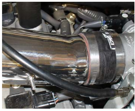
The intake is inserted into the throttle body hose and the intake bracket is lined up to the vibra-mount stud.