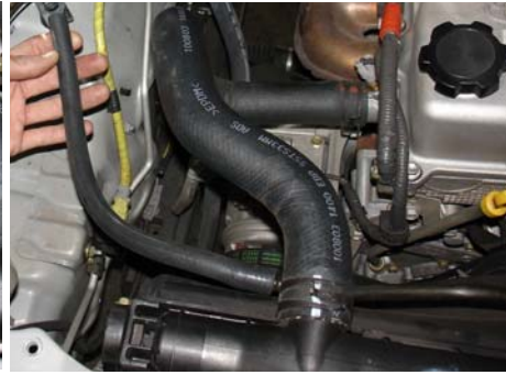
The 14"-10mm vacuum hose is now connected to the charcoal canister hard pipe.