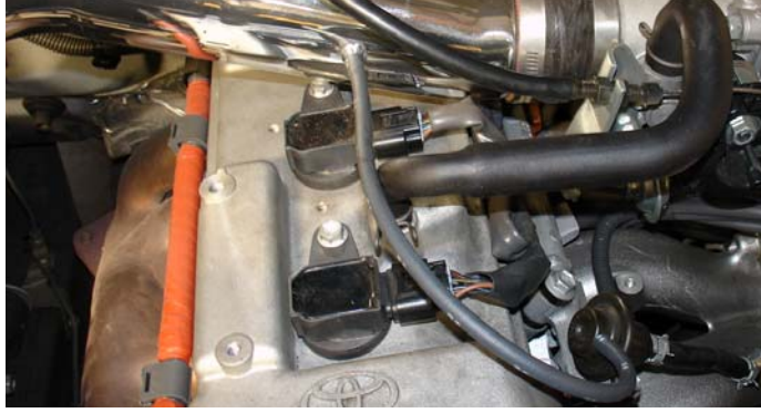
A good shot of the 4mm line connected to the pressure fuel regulator and the 3/16" intake port.