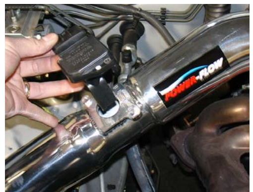
Take the mass air flow sensor and carefully insert it into the machined sensor adapter. we recommend you use a dab of light oil of water to wet the O-ring. This will allow the O-ring to slip into the hole for a better seal.