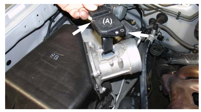
Remove the screws from the mass air flow sensor (A) and carefully pull the air sensor out of the sensor housing.