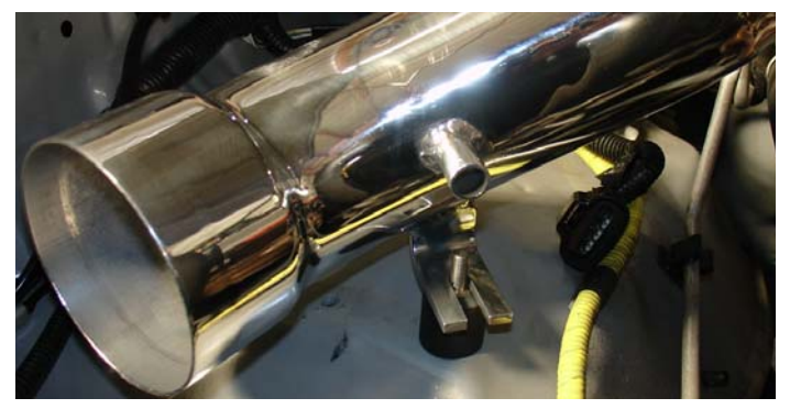
The intake bracket is sitting flush over the vibra-mount stud and lined up to the throttle body.