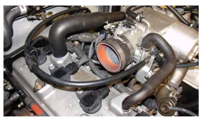
Press the 2 3/4" straight hose over the throttle body and use two power-bands. At this point, you will only tighten the band on the throttle body side.