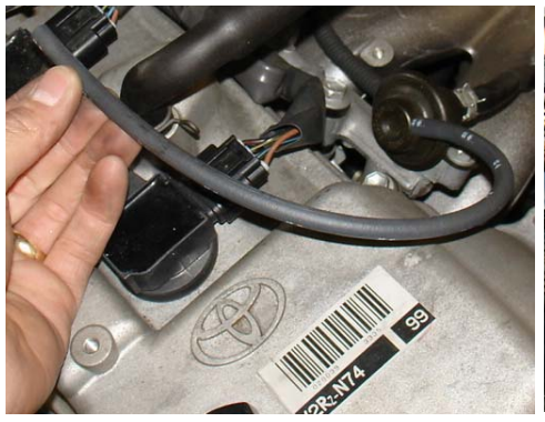
The stock 4mm hose remains on the pressure fuel regulator