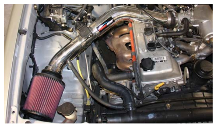
Congratulations! You have just completed the installation of the MR Tech intake system. Periodically, check the fitment of the intake system to make sure nothing has shifted or is rubbing up against anything. Regular maintenance will enhance the life of your intake system and protect you from possible voiding the warranty.