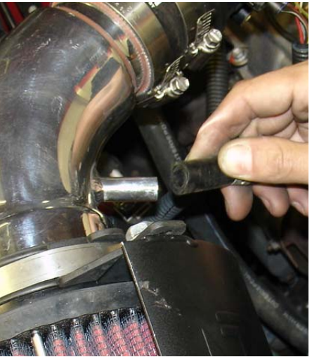
Once the 3/8" coupler and 6"-10mm hose have been installed continue to connect or press the hose over the 1/2" intake port as shown above.

The 6" 10mm hose is pressed over the 3/8" coupler from that leads over to the Evap charcoal canister. This line is used to extend the line to allow for slack.