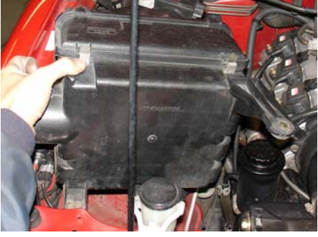
Remove the m6 bolts that secures the air intake box to the wheel well. Once all bolts have been removed continue to remove the entire air intake box from the engine compartment.