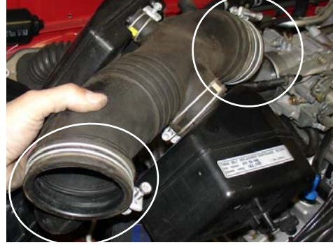
Loosen the two clamp located on each side of the air intake duct. Once the clamps have been loosened removed the entire air intake duct from the throttle body and air intake box.