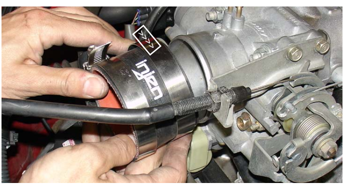
Press the 2 3/4" straight hose over the throttle body and use two power clamps on the straight hose, tighten the clamp located over the throttle body.