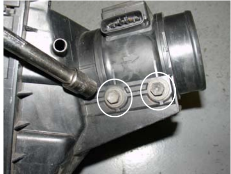
In order to remove the air mass sensor, the two m6 bolt will have to be removed.