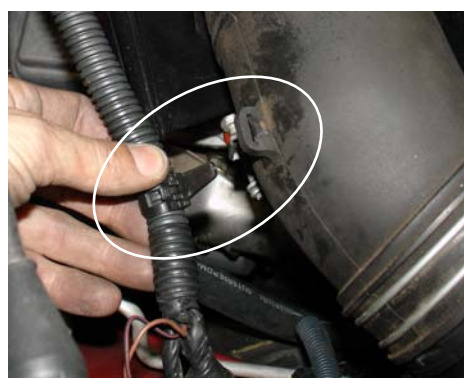
Disconnect the harness clip held on to the lower air intake duct.