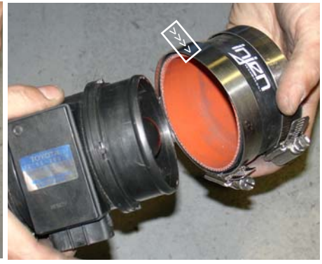
Press the 3" straight hose over the outlet end of the mass air flow sensor. Use two Power-clamps and tighten the clamp on the mass air sensor side.