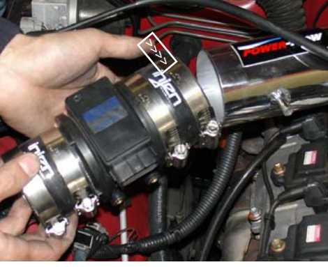
The outlet end of the mass air flow sensor is lined up to the primary intake. Semi-tighten the powerclamp on the intake side just enough to hold the mass air sensor in place.