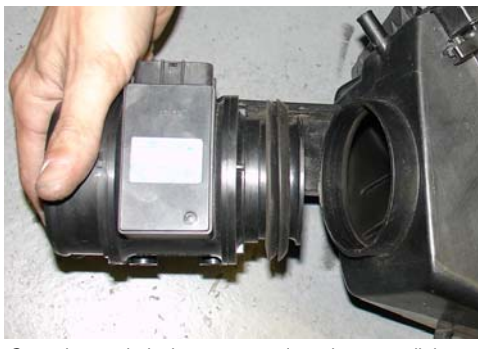
Once the two bolts have removed continue to pull the air mass sensor out from the air intake box as shown above.