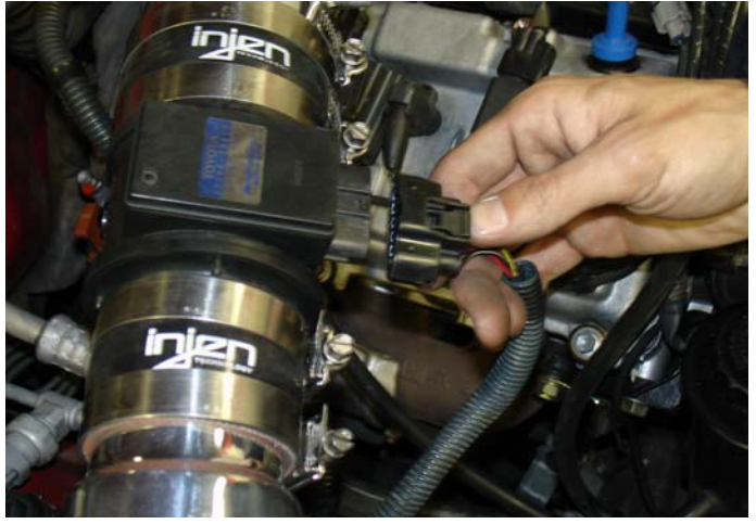
The sensor harness clip is reconnected. The harness is pressed over the air mass sensor until it snaps in place. When you hear the snap it usually means that the sensor and harness are properly secured.