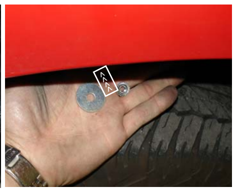
Reach underneath the wheel well and use the m6 flange nut and washer to secure the vibra-mount in place.