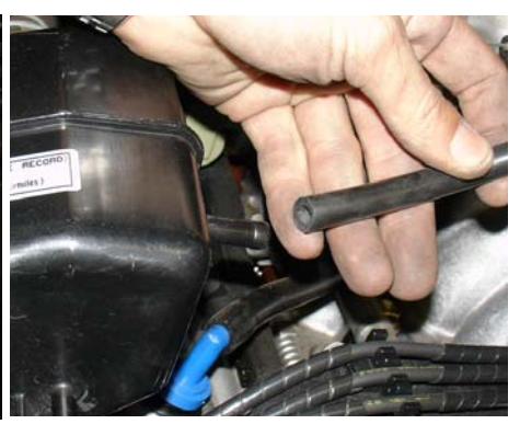
Remove the 6mm stock hose connected to the air intake resonator box. This hose leads to the fuel pressure regulator below the throttle body.