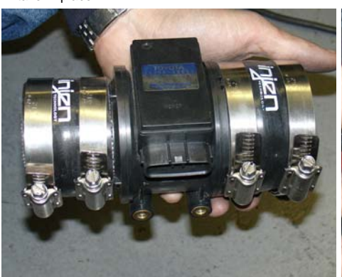
The mass air flow sensor is now assembled and ready for installation.