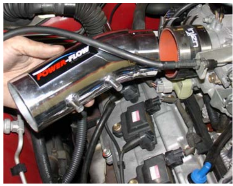
Take the primary intake and press the 2 3/4" end into the straight hose located on the throttle body. Semitighten the clamp just enough to hold the primary intake in place.