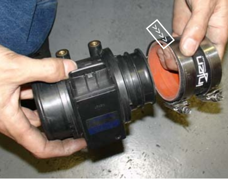
Press the 2 1/2" straight hose over the inlet side of the mass air flow sensor. Use to two Power-clamps and tighten the clamp on the mass air flow sensor end.