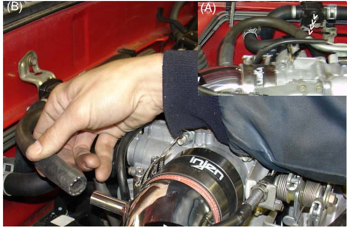
The stock crack case breather line is replaced with the 13" -10mm vacuum hose (A). Press one end over the crankcase breather port and connect the other end over the 1/2" intake port located by the firewall (B).