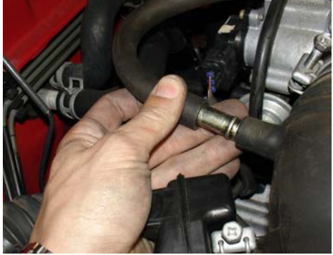
Pull the CC breather line from the air intake duct located by the passenger side firewall. The 13" 10mm vacuum line will be used once the intake has been installed.