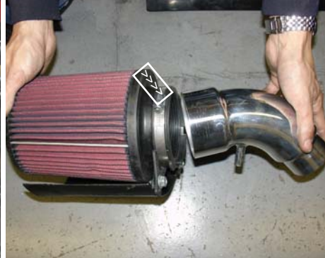
Press the 3 1/2" filter neck over the secondary intake as shown above. Once the intake has butted up against the filter neck stops continue to tighten the clamp. The Power-heat shield shown on the filter is an accessory not included in this kit.