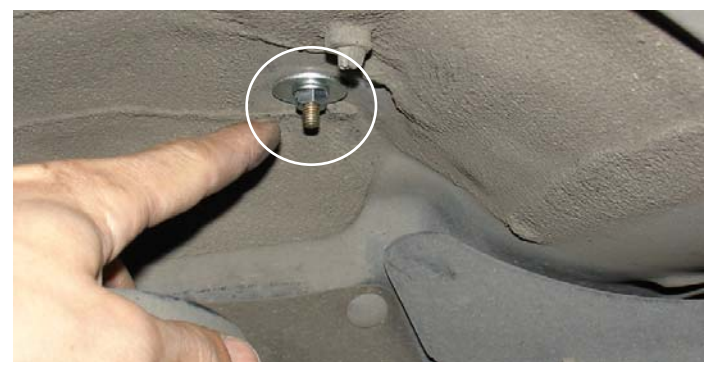
A shot of the m6 flange nut and washer from the wheel well securing the vibramount in place.