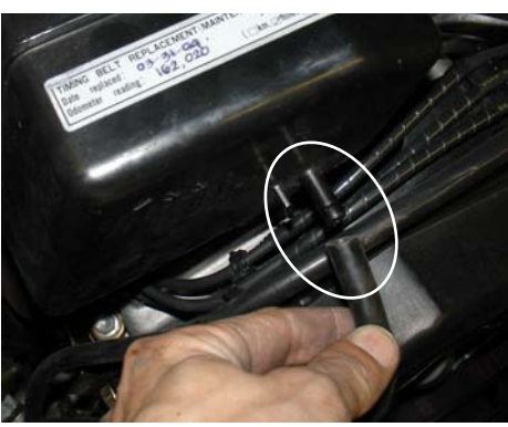
Remove the stock 6mm hose located on the side of the air resonator box. This line leads to the charcoal canister port located to the bottom.