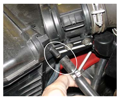
Remove the stock 10mm hose from the air intake box. This line leads Power steering sensor vacuum line located by the driver side fender well.