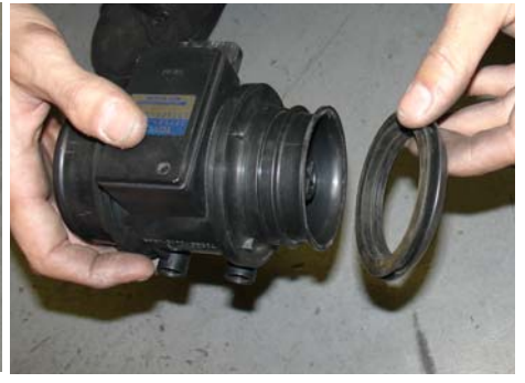
The sealing grommet has been removed and set aside. This grommet will not be needed to complete the installation.