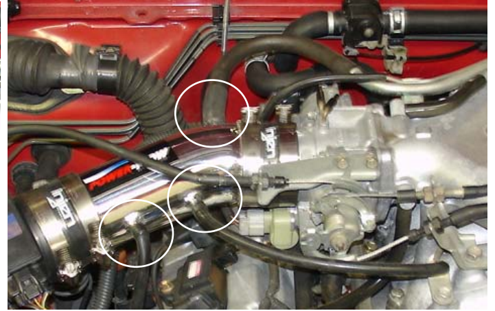
The vacuum lines that connect the pressure regulator port , power steering switch and the crankcase ports have all been installed.