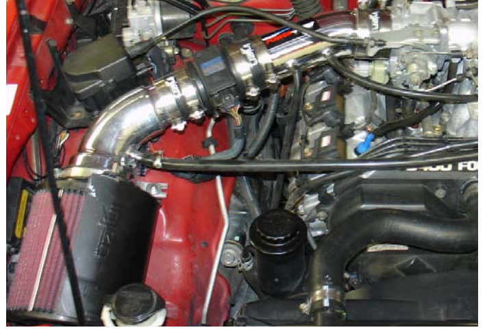
Congratulations! You have just completed the installation of the MR Tech intake system. Periodically, check the fitment of the intake system for safety precaution. Extra precaution will prevent possible damage to the intake system and or engine compartment. The Power-heat shield is sold separately on-line at injenonline.com