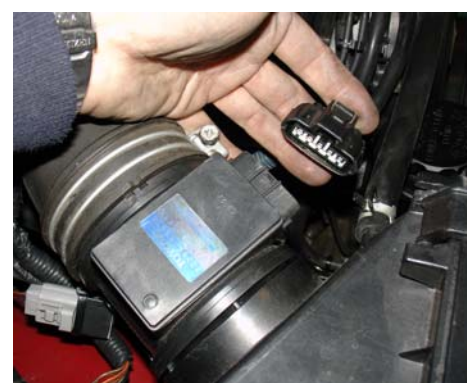
Disconnect sensor harness from the mass air flow sensor as shown above.