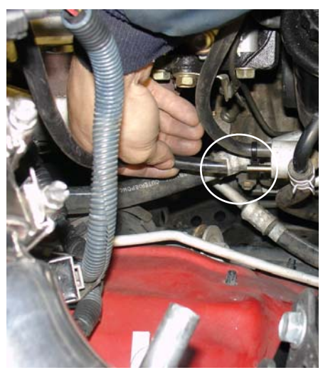
The other end of the 18" -6mm vacuum hose is pressed over the power-steering switch port as shown above.

The 18"-6mm vacuum hose is pressed over the second intake port located on the primary intake. The other end lead down to the to Power steering switch port.