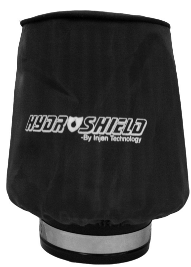
Hydro Shield Sold Separately