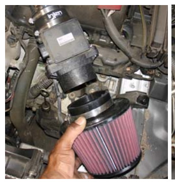
Press the 3 1/2" filter neck over the end of the composite flange.