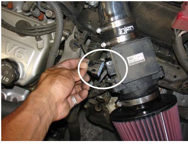
Reconnect the electrical mass air sensor harness prior to starting the engine.