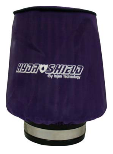
Hydro Shield Sold Separately

Now available, Hydro Shield by Injen Part Number X-1033