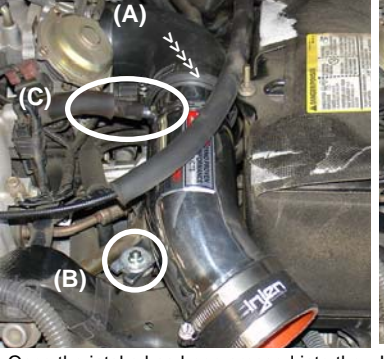
Once the intake has been pressed into the elbow on the throttle body (A) Align the intake bracket to the vibra-mount stud (B). Press the stock vacuum line over the intake port (C).