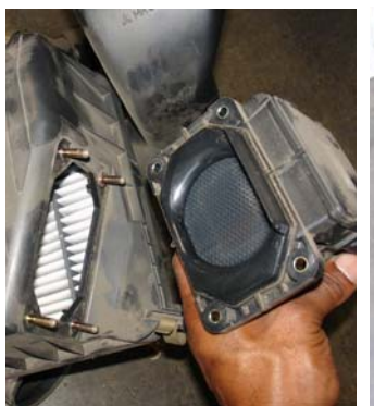
Remove the 4- 6mm nuts from the studs holding the MAFS to the air intake box as seen in the picture above.