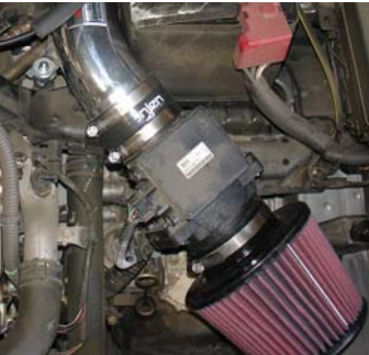
With the filter properly in place, align the intake for best possible fit.