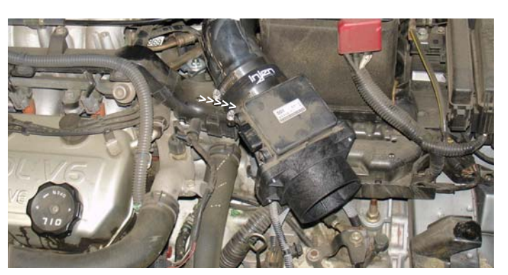
Take the assembled MAFS and press the outlet end into the 3 1/4" hose on the intake. Locate the MAFS for best fit and semi-tighten the large clamps used.