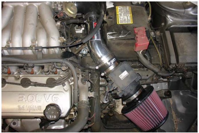
Align the entire intake for best possible fit. Check all lines, hose and fitment prior to tightening all nuts, bolts and clamps. Periodically, check the fitment of the intake and make sure it is not rubbing or hitting any moving parts.