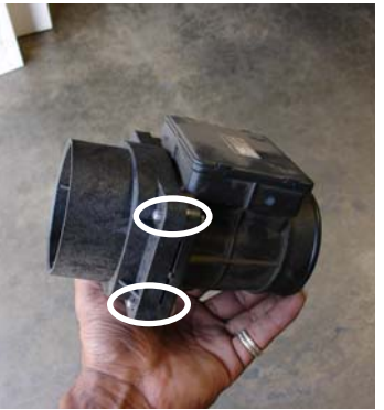
Take the finned composite flange, butt it up to the flat surface of the MAFS. Use the 4- 6mm flange nuts to bolt the flange to the MAFS.