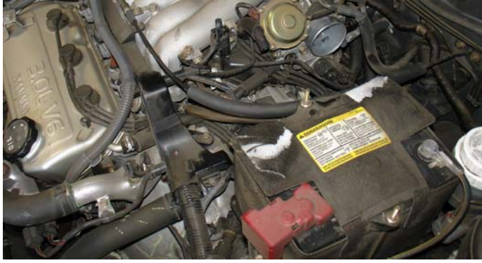
Engine compartment after the air intake box, ducts and air scoop have been removed.