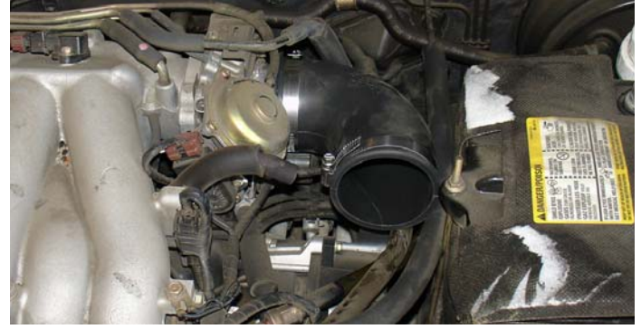
Take the 90 degree elbow and press the end with the velocity stack over the throttle body. Place a medium clamp (.048) on each side of the elbow and semi-tighten the clamp on the throttle body side.