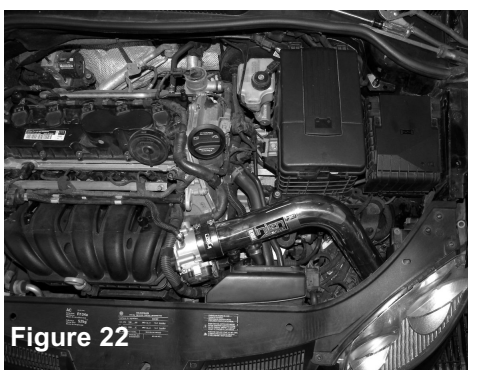
Check the alignment and fitment of the entire Injen intake. Once you have check for possible air leaks, rubbing or rattling, continue to tighten all nuts, bolts and clamps.