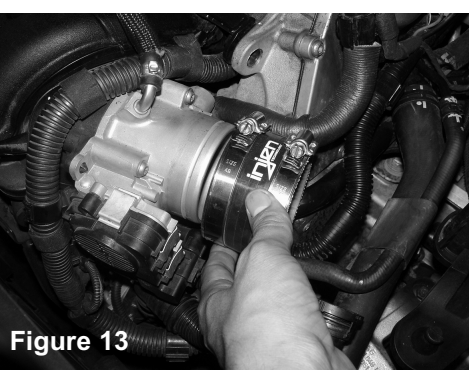
Place the 3.00" straight hose and 2 48 clamps onto the throttle body

Use a channel lock plier to loosen the pressure clamp on the throttle body and remove the plastic air duct from the throttle body.