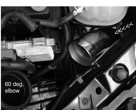
Top view of the intake inserted into the engine compartment before aligning it to the 60 degree elbow.