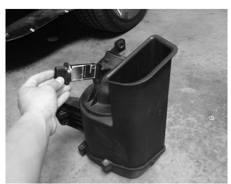
Remove the mass air sensor from the stock air box.