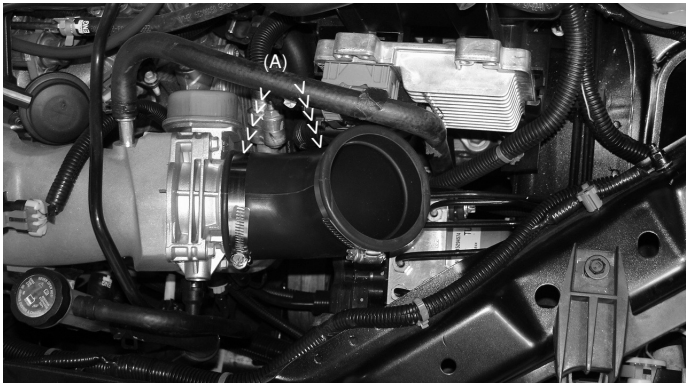
Prior to installing the elbow place a clamp over each end of the elbow (A). Take the 60 degree elbow and press the 2 7/8" over the throttle body. Position the 3" inlet side so that it faces upward.