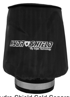
Hydro Shield Sold Separately

Now available, Hydro Shield by Injen Part Number X-1033