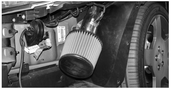
Congratulation! You have just completed the installation of the world's first tuned intake system. Use only Injen replacement parts when replacing parts. Injen recommends that you check the alignment of this intake system periodically in order to avoid damage to the intake track.