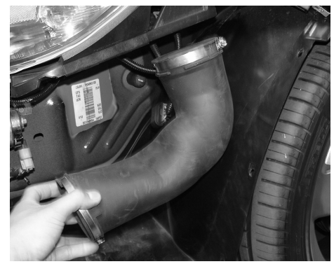
Remove the secondary air intake duct leading into the engine compartment. Use the included vinyl trim to line the air duct opening.