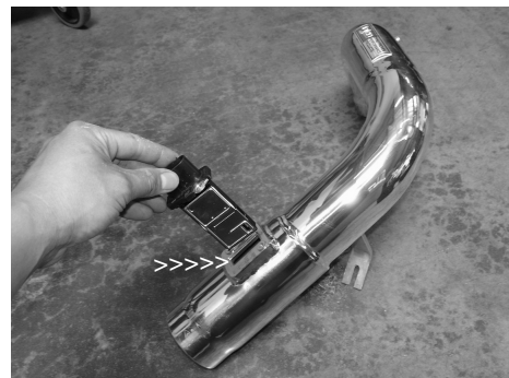
Carefully place the mass air sensor into the calibrated machined adapter.