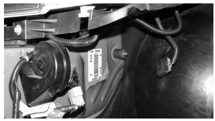
Take the vibra-mount and screw it into the pre-tapped 6mm hole. Screw the vibra-mount in until it completely bottoms out.