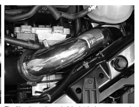
The 3" outlet on the end of the intake is now pressed into the silicone elbow as shown in this picture.