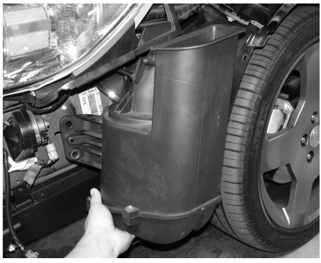
The stock air box is now unbolted from it's stock location.