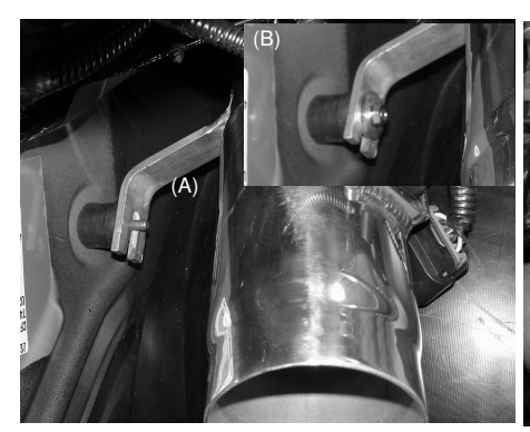
Once the top end has been pressed into the elbow continue to align the intake bracket to the vibramount stud(A). Use the 6mm nut and fender washer to fasten the intake in place (B).