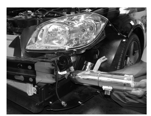
Carefully insert the 3" end of the intake into the corner bumper. Slip the 3" top end into the air duct opening that was lined with vinyl trim earlier.