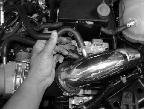
Take the stock crankcase breather line and press it over the 1/2" port on the intake, use the stock clamp to keep the line from slipping off.