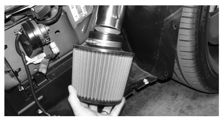
Press the Injen filter over the end of the intake as shown in this picture. Once the filter has been pressed in place continue to tighten the filter neck clamp.