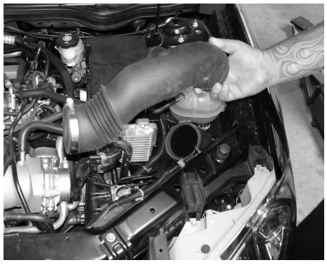
Remove the primary air intake dust connected to the throttle body and secondary air duct attached to the air box