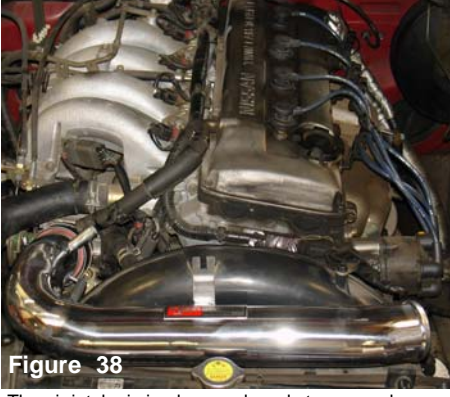
The air intake is in place and ready to secured.