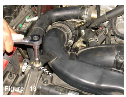
Loosen the m6 bolt from the radiator bracket as shown above.