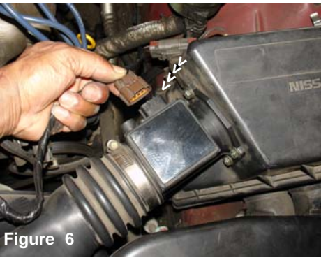
Depress the upper tab on the harness clip and disconnect the harness clip from the mass air flow sensor