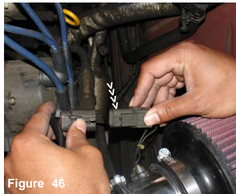
Insert the sensor connector into the air temperature sensor clip as shown above.