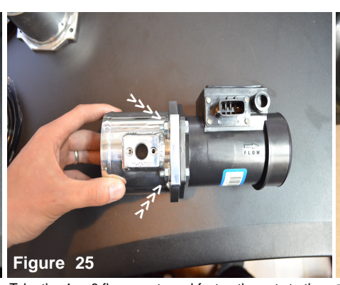
Take the 4- m6 flange nuts and fasten the nuts to the m6 bolts on the sensor flange. Secure them tight so that the flange is secure.