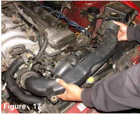
Once all clamps and bolts have been removed, continue to pull the air intake out along with the top air box cleaner.