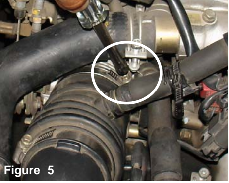
Loosen the clamp on the throttle body intake duct.