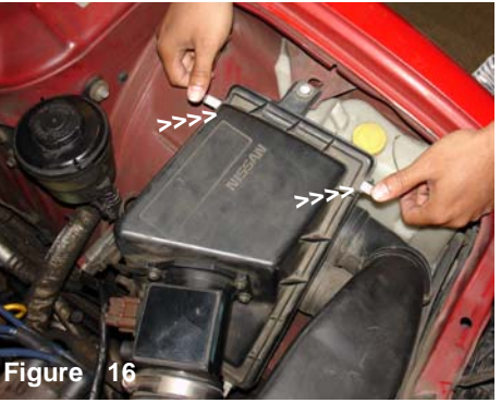
Disconnect the two clamps connecting the top air box to the lower air box.