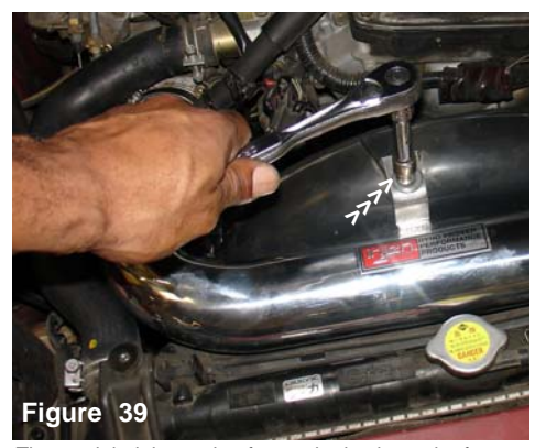
The stock bolt is used to fasten the intake to the fan shroud