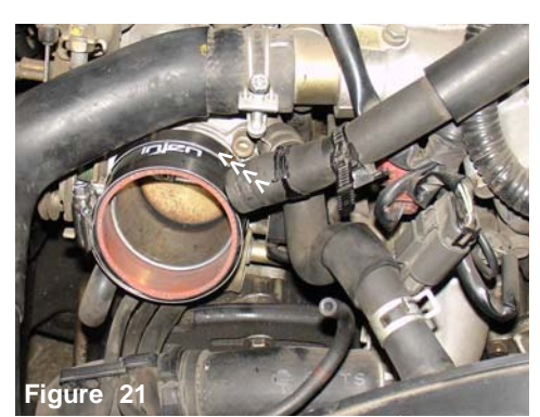
Press the 2 3/4" straight hose over the throttle body, use two power-bands on the hose but only tighten the clamp on the throttle body for now.