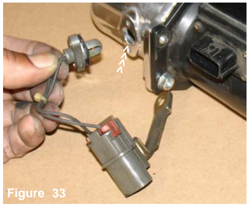
The sensor is now inserted into the sensor pad located on the filter flange. The stock screws are used to fasten the air temperature sensor to the sensor pad.