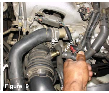
Once you have removed the tension clamp, continue to disconnect the CVC breather hose from the air intake port.