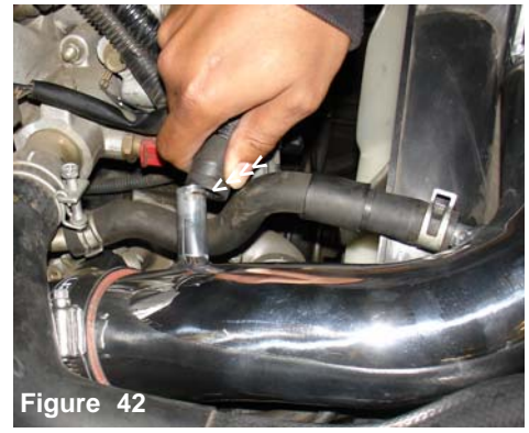
The CVC line is pressed over the large intake port by the throttle body. Use the stock clamps to secure the hose to the intake port.