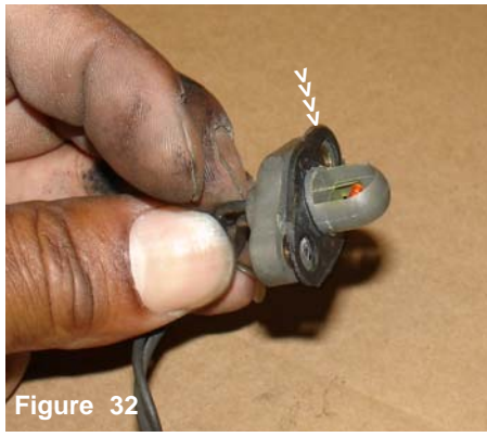
The gasket is placed on the air temperature sensor as shown above.