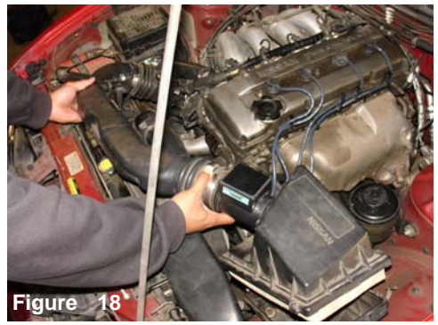
Here is another view of the air box cleaner and air intake pipe being pulled out of the engine compartment. Notice that the air filter panel is also pulled out.