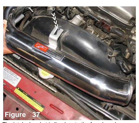
The intake bracket is lined up to the fan shroud threaded hole.