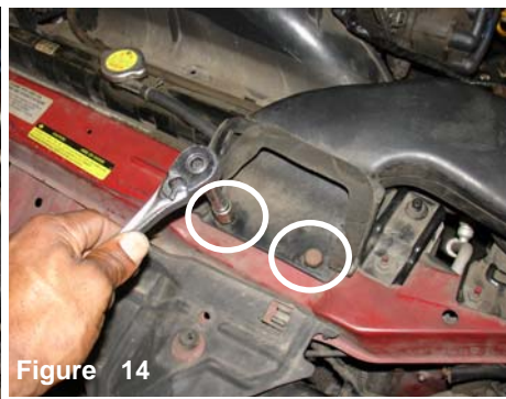
Loosen and remove the two m6 bolts holding the air scoop over the cross member.