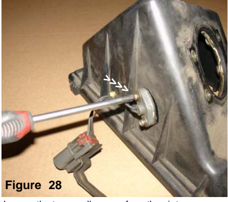
Loosen the two small screws from the air temperature sensor that fastens it to the upper air box cleaner.