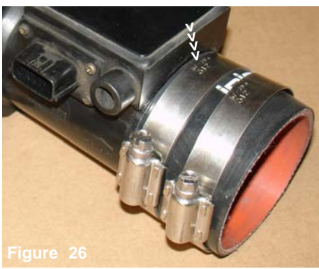
Press the 2 3/4" straight hose over the mass air flow sensor, use two power-bands on the straight hose. Tighten the clamp located on the mass air flow sensor.