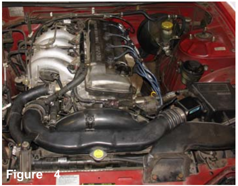
Stock view of the 240sx.