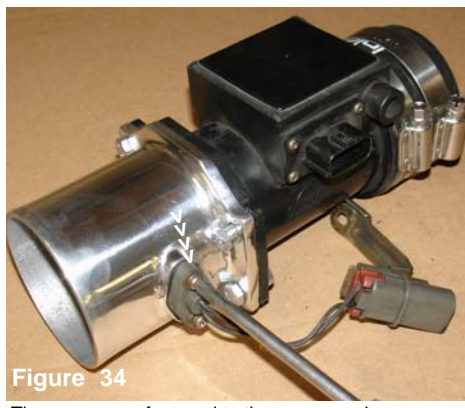
The screws are fastened to the sensor pad.