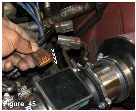
Press the electrical sensor harness clip over the sensor until it snaps in place.