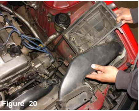
Now that the four bolts have been remove, continue to pull the front air scoop and lower air box cleaner for the engine compartment.