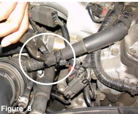
Using a set of pliers, depress the tension clamp on the hose and pull the clamp away from the air intake port