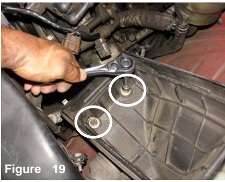
once you have pulled off the top air box lid, continue to loosen and remove the two m6 bolts located on the bottom of the air box.