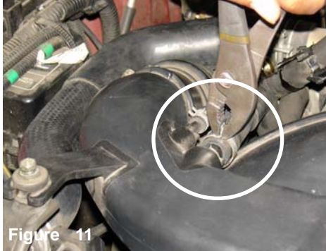
Depress the tension clamp on the air bypass line and pull the tension clamp away from the air intake port as intake port. shown above.