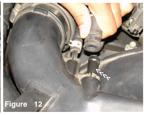
The air bypass line is disconnected from the air intake port.