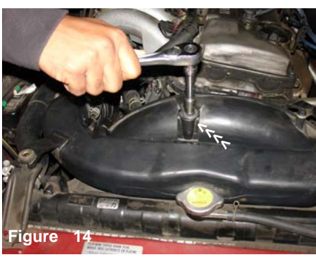
Remove the bolt located over the fan shroud. This will allow you to remove the air intake.