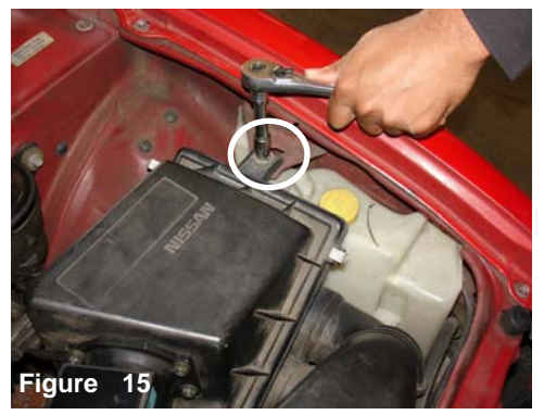
Loosen and remove the m6 bolt holding the top air box to the fender well brace.