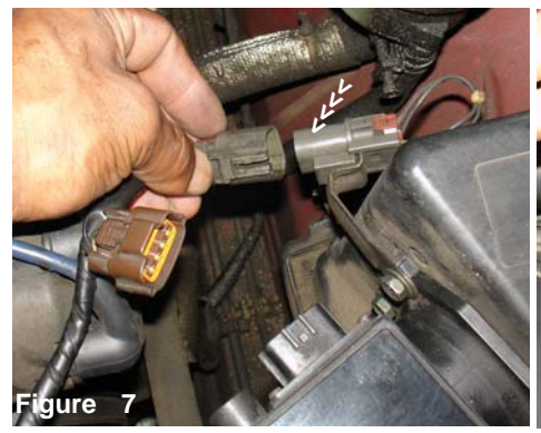
Depress the tab on the harness clip connected to the air temperature sensor and remove the harness clip.