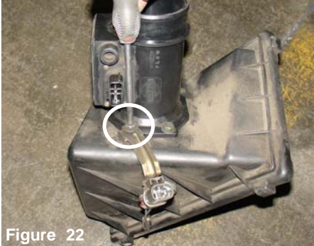
Remove the first bolt from the mass air flow sensor housing that holds the harness bracket and harness clip