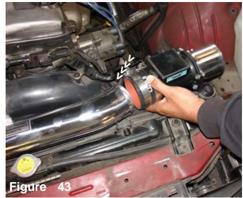
The assembled mass air flow sensor is now pressed over the end of the intake, Semi-tighten the powerband once the air sensor has been adjusted.