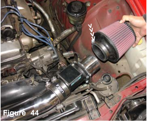
Take the filter and press it over the intake end. Once the intake is butted up against the filter stops, continue to tighten the filter clamp.