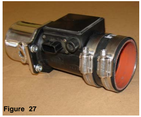
The mass air flow sensor, filter flange, straight hose and power-bands are now assembled.