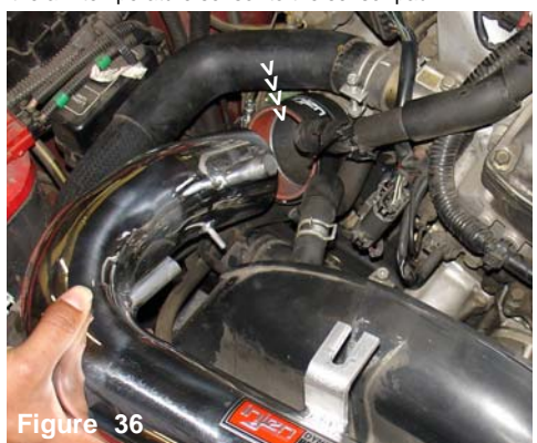
Take the Injen intake and lower it into the engine compartment, over the fan shroud. The intake is pressed into throttle body hose.