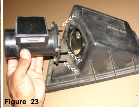
Remove the additional m6 bolts from the air box cleaner top and remove the mass air flow sensor as shown above.