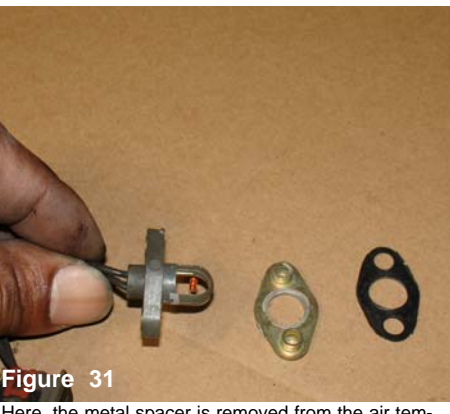
Here, the metal spacer is removed from the air temperature sensor along with the gasket. The gasket is replaced and used in the application.