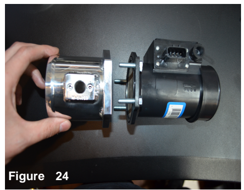
Take the sensor flange and 4- m6 x 25mm bolts and butt it up to the mass air flow sensor.