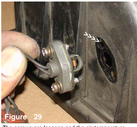
The screws are loosens and the air temperature sensor is removed from the air box top.