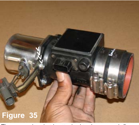
The sensor bracket is attached to the mass air flow sensor bolt.