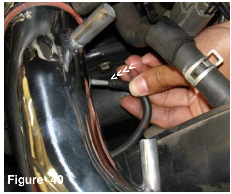
The vacuum switching valve line is pressed over the 5mm vacuum port.