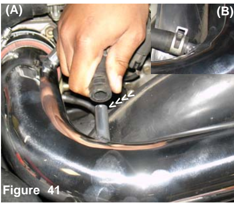
The air bypass line is now pressed over the large intake port by the fan shroud (A). The stock clamps are used to secure the hose over the intake port (B).