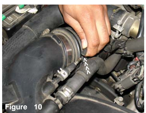
Disconnect the vacuum switching valve line from the air intake port coupler.