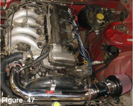
Congratulations! You have now completed the installation of this intake system. Periodically, check the fitment of your intake to check for shifting that can cause damage to your engine.