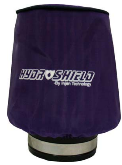
Hydro Shield Sold Separately