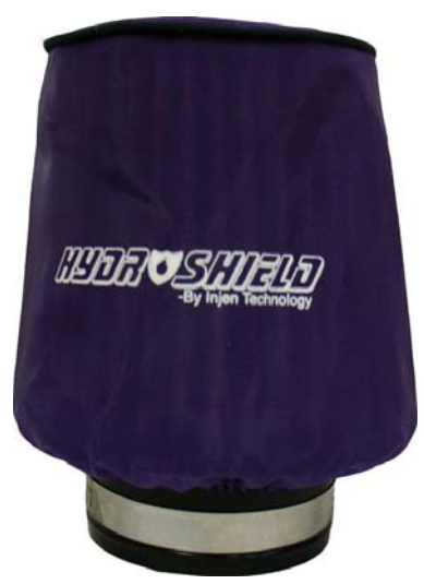
Hydro Shield Sold Separately